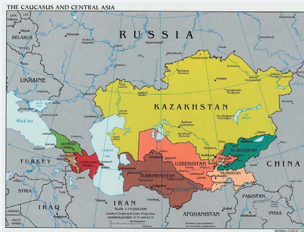
Figure 1 Map Central Asia.